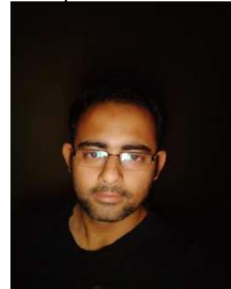
with Spectacles X