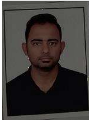
Too Dark X