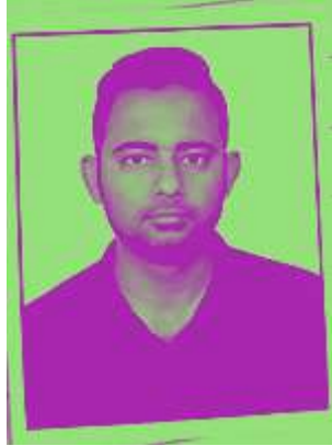
Too much Extra Color X