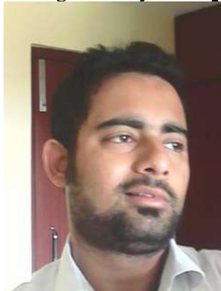
Facing Sideways X