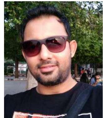
With Goggles X