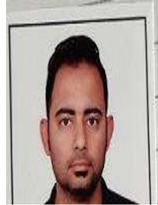
Too Close X