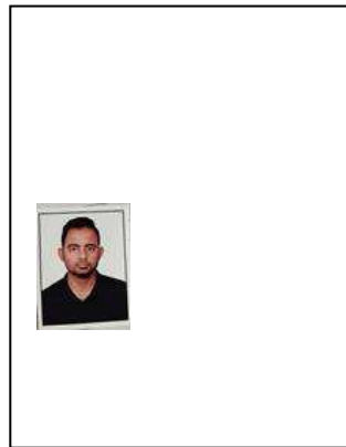
Too Small X